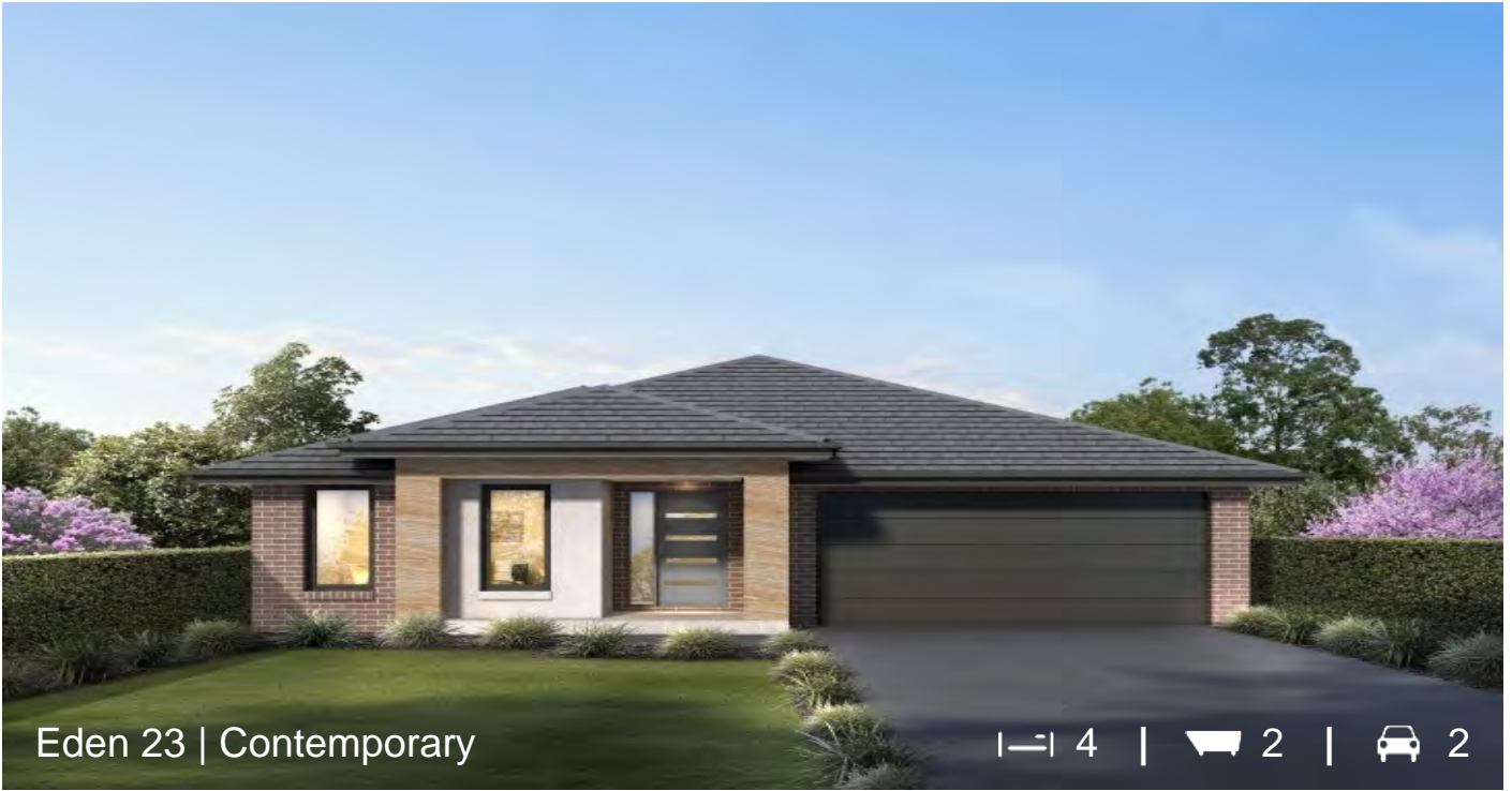
Eden 23 | Contemporary