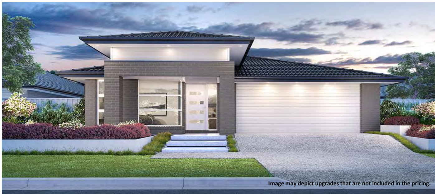
Image may depict upgrades that are not included in the pricing.

Floor area: 244m 2 / 26.23sq | Block Size: 508.2m 2 Address: Lot 207 Tillage Drive, Lochinvar